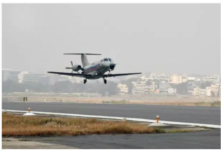
Saras debuts at HAL airport.