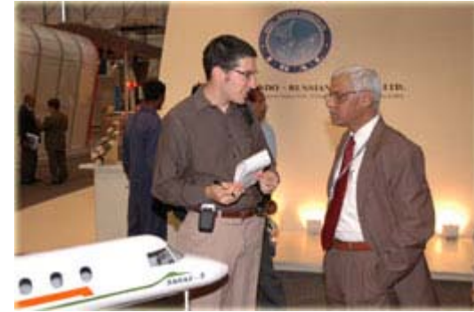
Photographs taken by our colleagues at Information Management Division

HANSA's flying display at Aero India 1998